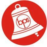
Bacton Primary School