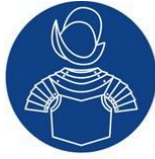
Mendlesham Primary School